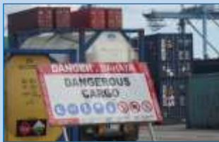
Kargo Berbahaya Dangerous Good Area