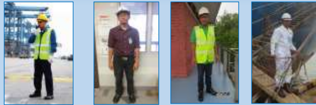
Kakitangan Staff Pelawat Visitor Kontraktor Contractor Pelaut Seaman

Pakai alat-alat keselamatan di kawasan operasi -Pelindung kepala, kasut keselamatan dan pakaian pemantul cahaya. Personal protective equipment are mandatorily required in operations - hard hat, safety shoes & safety vest.