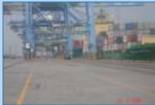
Dermaga Kontena Container Wharf