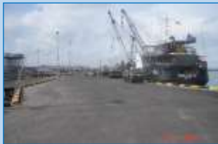
Kargo Konvensional Southpoint Conventional Cargo