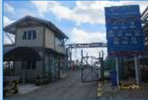
Terminal Cecair Pukal Liquid Bulk Terminal