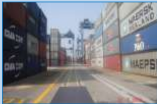
Lapangan Kontena Container Yard