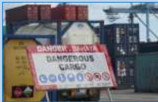
Kargo Berbahaya Dangerous Good Area